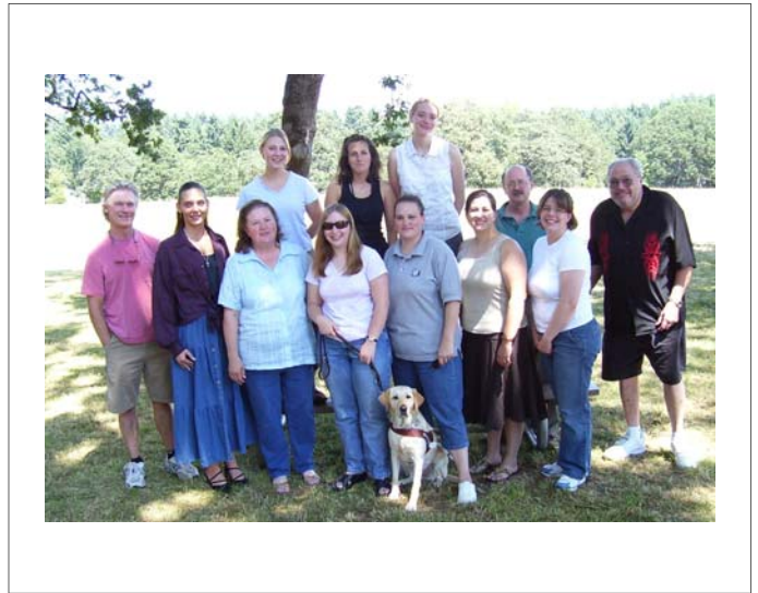
AmeriCorps*VISTA members with members of the 'Building Bridges' Advisory Council at Orientation in July 2006.

'Building Bridges' VISTA members provide "indirect service" and are not allowed to participate in direct service activities such as tutoring, mentoring, or case management. They instead focus on capacity